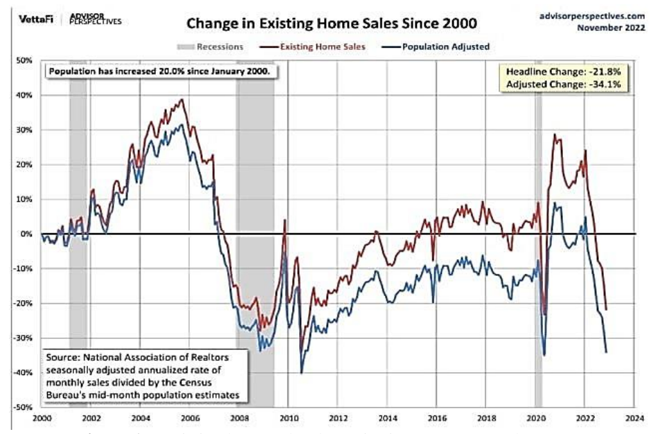
Figure 1 – Existing home sales dynamics in USA (Katsenelson, 2022)

From January, 2022 to November, 2022, existing home sales plummeted from 6.5 million a year to 4.09 million a year (minus 37 %) with sustained momentum to renew the low of the COVID crisis (about 4 million sales in mid-2020). In monetary terms, current sales are approximately $ 320-330 billion per year compared to $ 530-550 billion in 2021 (volumes are falling and prices are falling). Nearly 200 billion revenue cut-off and only one segment – new single-family homes (Katsenelson, 2022).